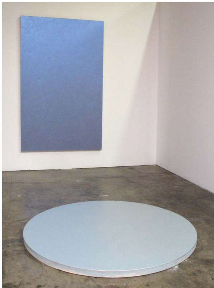
David Simpson True Blue , 2000 and Light Well #5 , 2007

The works of Winston Roeth , David Simpson , Marcia Hafif , Max Cole , and Fred Sandback , all painters with the exception of Sandback, create a narrative of perception with the viewer. Grounded in phenomenological rather than symbolic or descriptive strategies, and seen within the context of specific architecture and light, the act of perception becomes its own narrative. Each artist's work heightens the conditions and relationships which influence the experience of particular works of art. Consisting of non-objective and sometimes monochrome objects, on careful inspection the viewer can perceive the underlying complexity of the works presented, leading