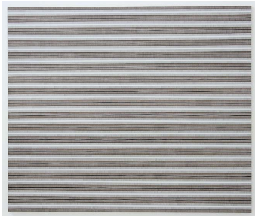
Max Cole luft , 2009

Sandback's sculpture, in this exhibition a two-color Corner Construction , delineates space with stretched acrylic yarn, creating a "sculptural space without an interior." 14 Widely regarded since his debut in the late 1960s while still a graduate student (having switched