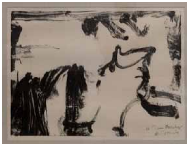
Willem de Kooning Untitled (Abstract)