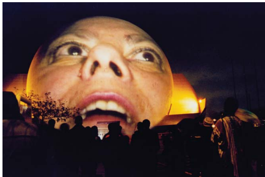
Krzysztof Wodiczko Tijuana Projection , 2001/2004