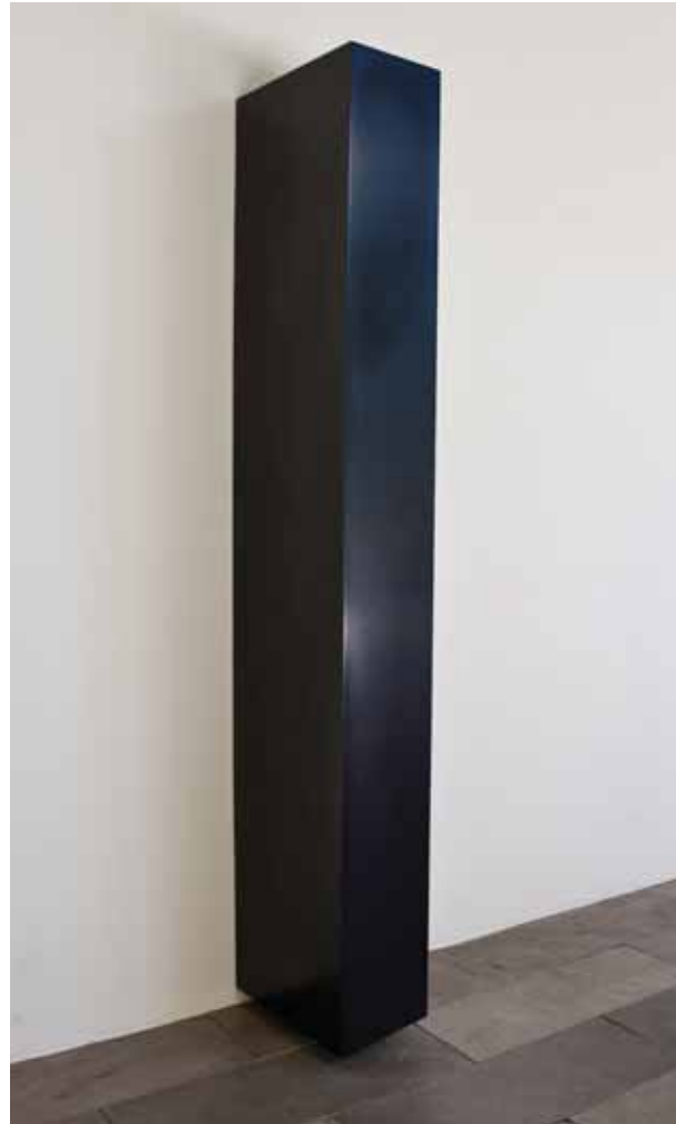
Susan York Tilted Column , 2008

Deborah Hede’s drawings are composed of many layers of charcoal. Starting with the inherent grid laid within the handmade paper she uses, Hede draws a 1-inch square grid over that in pencil. On top of that pale guiding grid, Hede applies as many as 15-20 layers of charcoal, saturating the paper and creating a residue of charcoal dust. She then pushes the dust into patterns that sometimes follow the grid and sometimes work against it. Each drawing is fixed in stages and the resultant pieces are heavy, delicate and fragile. Over time, Hede has introduced color into her drawings, as well as imagery, which includes fragmentary walls, vegetation and arches. She has described