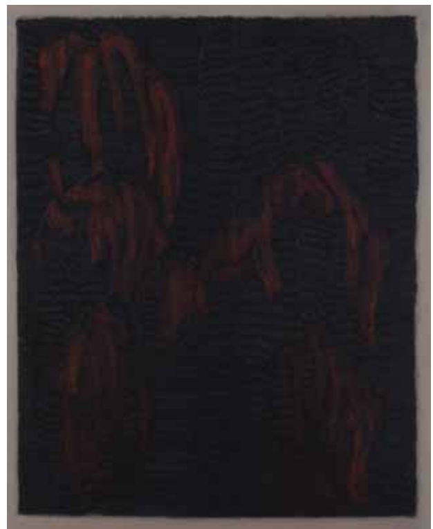
Deborah Hede Hidden Interval #2 , 2008