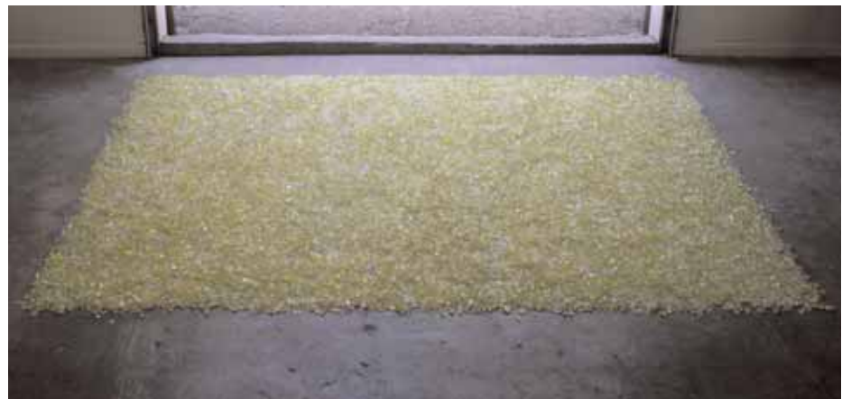
Rebecca Holland Crush , 2008

their paper supports. Holland's cast-sugar planks are translucent, but so intensely colored that they create intervals of contrasting color between them so that they flicker. The wall behind them and the air in front of them become indistinguishable from the planks themselves, as they move in and out of focus. York's geometric graphite forms refuse to stay still. The soft sheen of their surfaces makes them appear to be liquid and, like mercury, they slip from one's grasp, their apparently straightforward geometry shape-shifting into fluid curves and planes.