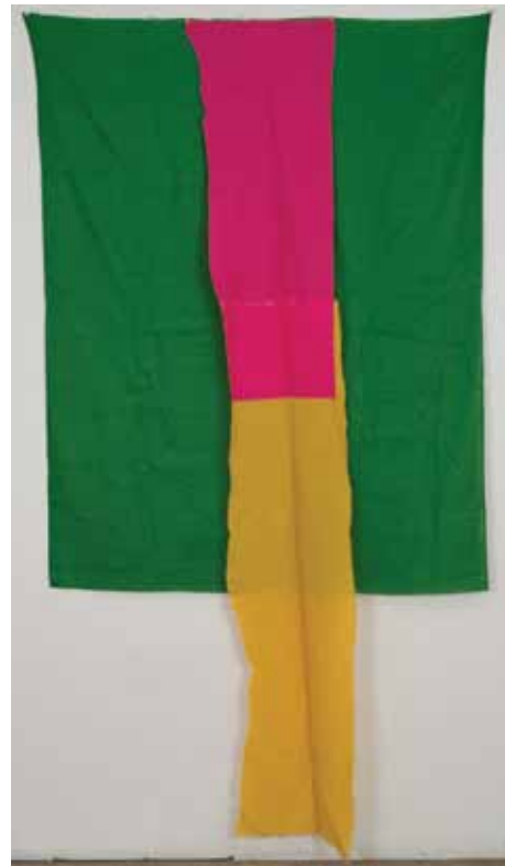
Joe Fyfe TALAT SAO , 2011

Rhee's Wind Egg gourd sculptures are evocative of ancient ritual and common use. Some are embellished with jewels, sport light bulbs, or are adorned with rich painterly swashes of color. Like a steampunk Brancusi, the work is at once familiar and alien. Rhee's practice deploys formal historic motifs of sculpture, such as the totemic forms of Second Bird of Passage , and the Arp-like forms of the Wind Eggs . They simultaneously engage in deliberately impermanent materials, such as the gourds themselves, that relate to folk and craft applications.