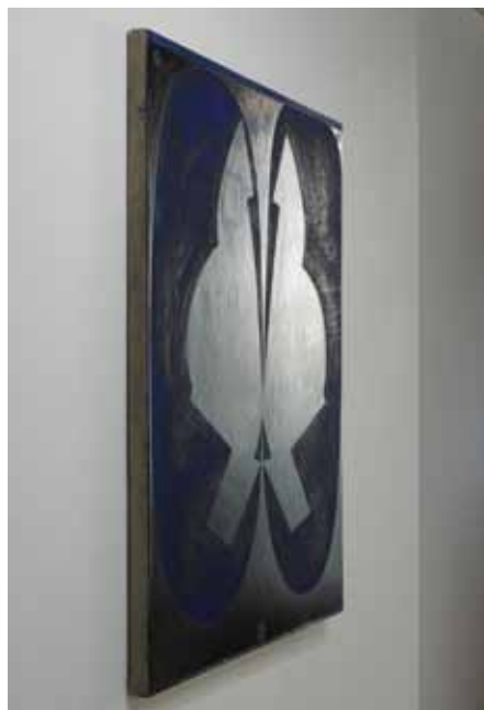
Nathlie Provosty Miran, 2012

present exhibition lies in their ability to reach across time, materials, and borders. ■