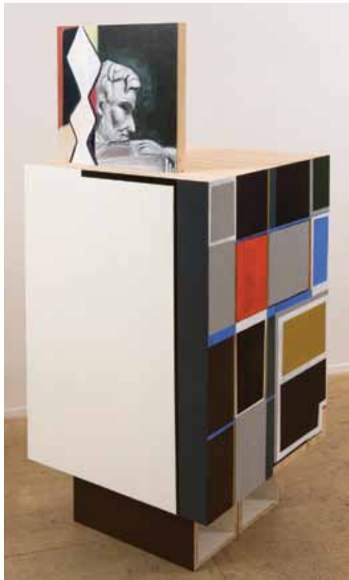
Pam Lins Lincoln Bookend Obstruction , 2010

Eating these delights in a local coffee shop, we (the curators) came to realize that our conversations about art and these hybrid pastries were related. Planning Donut Muffin , we had conversations with artists approaching painting from a sculptural perspective. We discussed sculpture as drawing, and light as painting. We came to realize that in contrast to the orthodoxy of Modernist and subsequent postmodern practices, these artists embrace porous and iterative approaches to art-making, and in so doing, acknowledge the ever-shifting experience of the viewer. We saw the studio and talismans of everyday life folded into formal practices of painting and sculpture. Hierarchies of art objecthood and materiality were being challenged. Above all, we found the