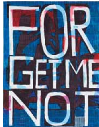
EJ Hauser forgetmenot , 2012