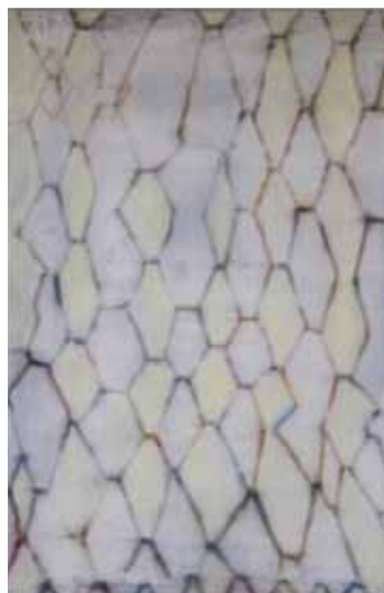
Clinton King Confetti you make me cry , 2012

role of memory and perception, the subjective and emotional aspects of art-making and experiencing art, at the forefront of discussions about their bodies of work. This last alchemic piece encompasses the attitude and position of Donut Muffin : transcending two worlds through unification of seemingly contradictory camps—painting and sculpture, conceptual and intuitive, the space between intention and perception.