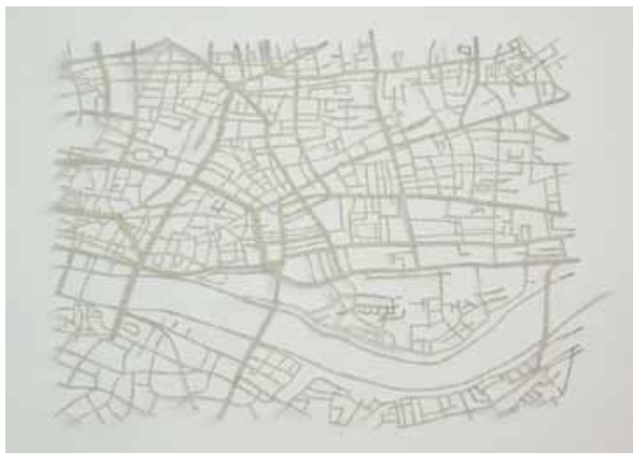
Rosana Ricalde Invisible Cities (London) , 2012

but in other parts of the world its reasons are apparently different. In Inbal Abergil's photograph, she encapsulates the essence of a market in Cairo during Ramadan. The energy she captured echoes the demonstrations of Tahrir Square, perhaps the most iconic of all that took place during the “Arab Spring,” as the recent wave of protest in the Middle East and North Africa has become known.