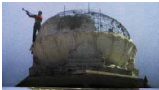
Sreshtha Rit Premnath I Will Die When I Stop Building , 2012

The expression “peace line” was employed by Nada Prlja in a work installed in Berlin’s Friedrichstrasse in the spring of 2012. A wall was built between an affluent area next to Checkpoint Charlie, in which tourists are conspicuous, and a poor neighborhood.