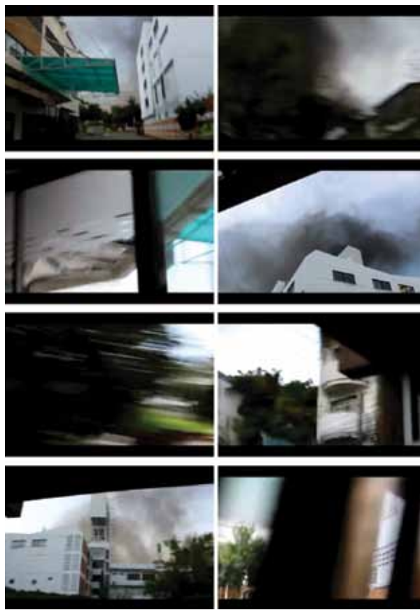
Alejandro Vidal An Uncontrollable Accumulation of Unintended Consequences , 2011

In the Northern Hemisphere, turmoil is provoked by the economic meltdown,