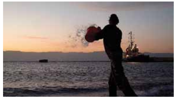
Francis Alyš Watercolor , 2010