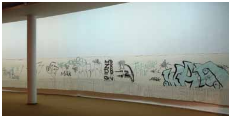
Tania Candiani Stitched Graffiti , 2009

architectural complex built by Ramaiah in the 1960s and that has been demolished and reconstructed on multiple occasions over the last decades. The work calls attention to the progression of urban space to a self-destructive mode and to the role played by power structures in this process.