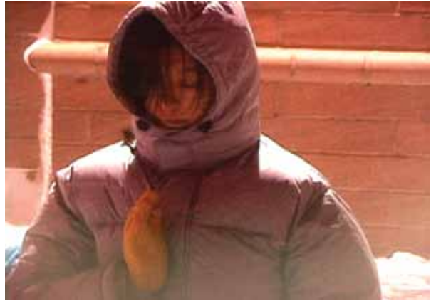
caraballo-farman Contours of Staying , 2004

The social order is regularly disrupted in times of war. The 21st century is marked by “permanent war” 4 —e.g., the “War on Terror” among others—as philosophers