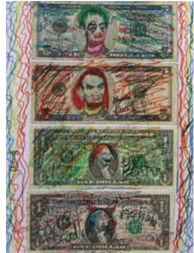
João Louro In God We Trust , 2005-12

Tania Candiani addresses the marginalization of the urban space by looking at graffiti as an outsider language. Her hand-made tapestry reproduces tags painted on the facade of a building somewhere in Eastern Europe, although such aesthetics is conspicuous in metropolises. The work considers the