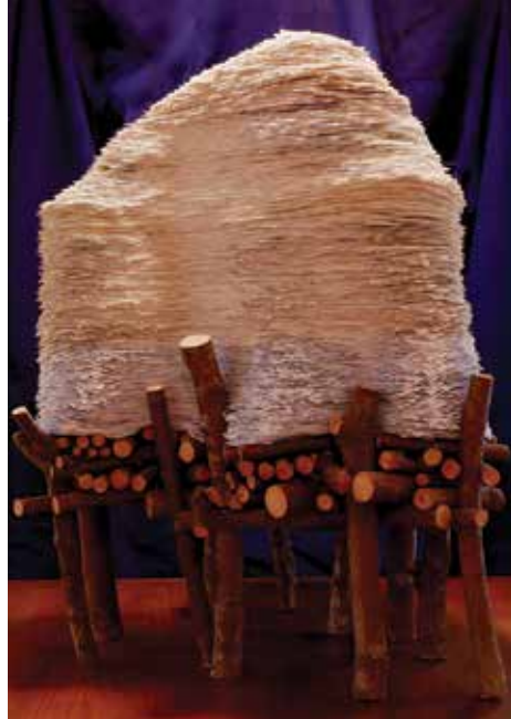
Steven Siegel Paper #3 , 1997

Ephemeral Streams and Waters of the US (2020) comes with a political and social subtext. It responds to the new definitions outlined in the Trump administration's repeal of the Clean Water Act (CWA). As of September 2019, ephemeral streams, flowing only after rainfall, and intermittent streams, flowing only during certain times of the year, are no longer considered Waters of the United States (WOTUS). These streams comprise nearly 70% of all waterways in the U.S., and affect one-third of the nation's drinking water resources. The revised definition not only has health, pollution, and development implications, but it perpetuates a conception that waterways are individual and separate entities. In response to Whitman's The Voice of Rain , this artwork visually links the stream and the cloud as inseparable entities,