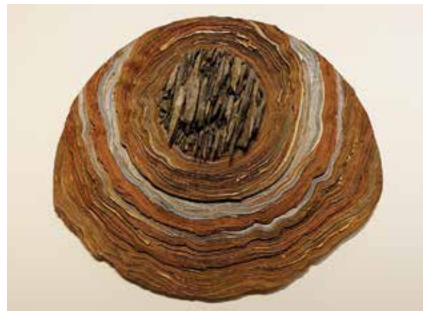
Steven Siegel Loom , 1994