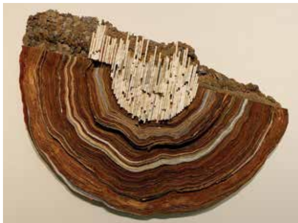
Steven Siegel Tiles , 1995

Often bringing together disparate elements into a unified whole, Siegel questions the boundaries between natural and man-made. The juxtaposition of industrially produced and natural materials, such as in Tiles (1995) refers to the way he understands nature: "I don't really believe in the word "natural", because I believe that we are the landscape, not only by our physical presence, but also by the messes we leave and the way we reconfigure all of the material around us—the roadway to the recycling of cans to nuclear waste. Our presence is there in every molecule." This view appreciates the whole earth as a one complex ecosystem where living species and non-living ele-