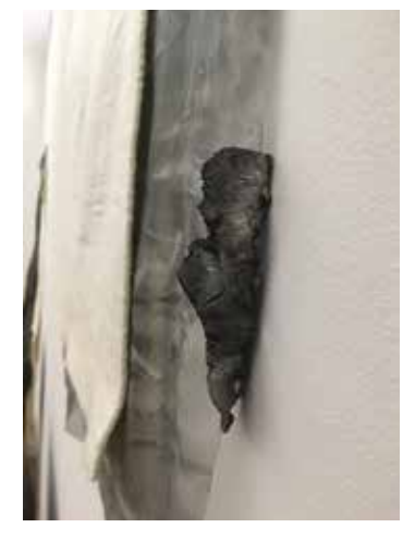
Martha Tuttle Untitled (detail), 2017

body into the artworks materiality are further illustrated between the stillness when the fabric is stretched, and movement when it is freely pinned to the wall.