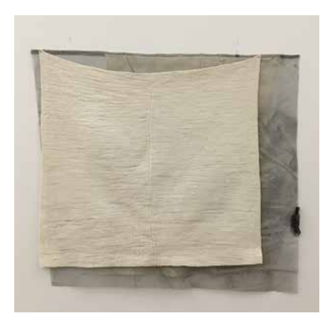
Martha Tuttle Untitled, 2017

Tuttle spins her own thread, weaves, and dyes her own fabrics, rather than working with found or commercially produced materials. The artist's touch is not just on the surface of the work, but embedded into its very being. This transference of energy from the artist's own