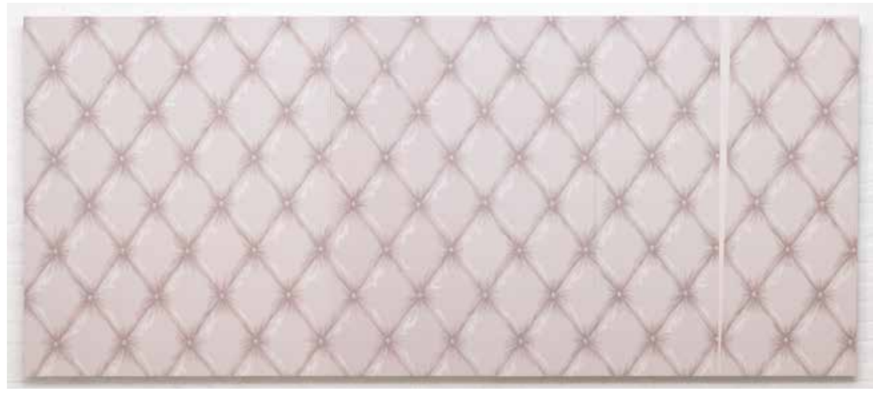
Alex McQuilkin Untitled (Lavender Bouttoniere), 2017

Her designs are distinctive of class (or at least the aspirations of class), of social structures, and social expectations. The palette of soft pinks, purples, and blues are pleasing, non-confrontational, and nostalgic.