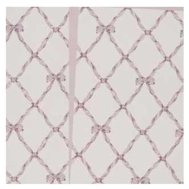
Alex McQuilkin Untitled (Purple Zip), 2016

Yet the viewer's eye catches the imperfections where a repeat ends abruptly or where there is a rupture in the pattern. Things are pushed up against each other in a forced, uncomfortable way, beneath the veneer of perfection and gentility.