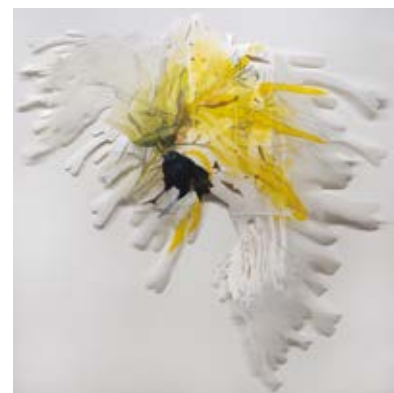
Resa Blatman Standing Crow , 2015

Resa Blatman's (Somerville, MA) recent work is inspired by a 2015 artists' residency to the Arctic Circle aboard an antique sailing vessel. She creates paintings and installations on PVC, aluminum, wood panels, and Mylar that speak to a warming planet, rising tides, and dying oceans—and to the ways these phenomena are transforming our landscape and natural resources. Blatman's work has been exhibited throughout the US and can be found in numerous public and private collections in the US and abroad.