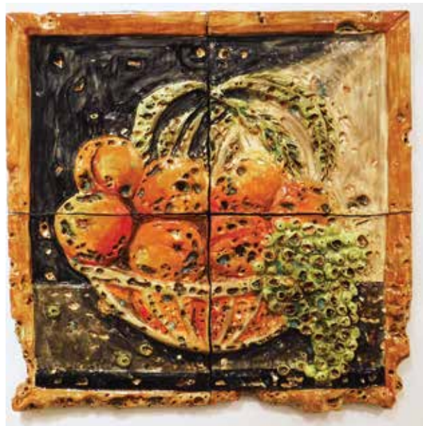
Valerie Hegarty Bowl of Peaches with Holes, 2017

Working with glazes and clay requires dedication, patience