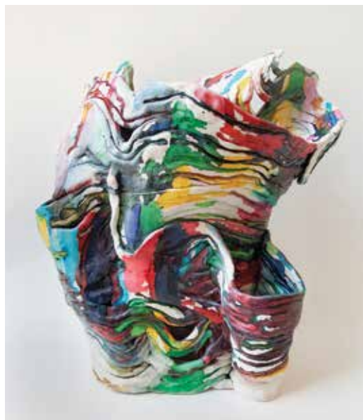
Joanne Greenbaum Untitled , 2016

Arlene Shechet's paper pulp drawings are cast from molds made of firebricks used in building and repairing kilns, referencing the durational firing process of ceramics. She describes them as having a "reciprocal relation-