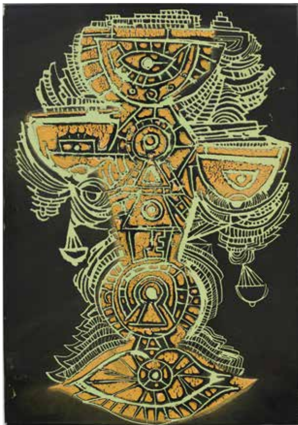
Julia Kunin Untitled Figure on Black, 2017

The current revival of interest in ceramics by artists, galleries, museums, collectors and audiences alike can be attributed to a confluence of factors: changing attitudes about the medium; a natural impulse to embrace the handmade in the wake of technological imperatives in art making; and the increasing number of contemporary artists who have turned to multi-disciplinary practices, blurring the lines between painting, sculpture, drawing, collage, photography, 3-D rendering, video and installation. This blending of mediums has led some artists with backgrounds in painting and sculpture to explore ceramics as an adjunct to their practices or even embrace it as their primary medium. Working with ceramics—from molding or casting to the application of glazes and multiple firings—are slow, meditative and deliberate processes. Shaping is done with the hands, leaving a record of gesture in the form itself. Ceramic artists also freely challenge traditional approaches by combining clay with other mediums, altering or creating glazes to suit their needs,