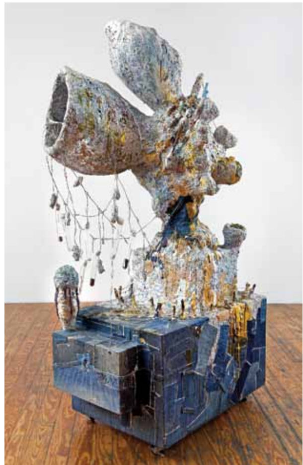
Randy Wray Accelerator , 2011

Salvaged wood collected from building sites, landfills or nature, is common to the work of both artists. Simms