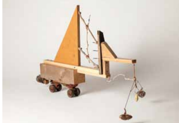
Arthur Simms Roman Soldier , 2010

In Roman Soldier , 2010, Simms mounts a precarious looking contraption on an old metal roller skate. Hanging off the front end is a Calder-esque mobile of wire wrapped rocks. Face Mon , 2014, employs feathers representing flight and wheels reflecting the artist's profound interest in development, evolution and action, not only of the physical sort, but also of deeper, more lyrical transformations. Simms' sculptures, while heavy in weight, often contain a sense of energy and nimbleness. There is a distinct feeling of a kinetic continuum in which the artist is telling multiple stories. The tightly bound wood structure in The Blue House , 2011, 2015,