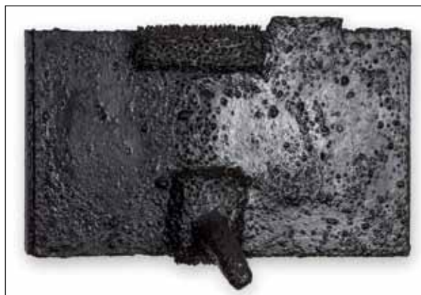
Arthur Simms Black Penis , 1989

I speak to them as if they were people... Sometimes, they answer me back."