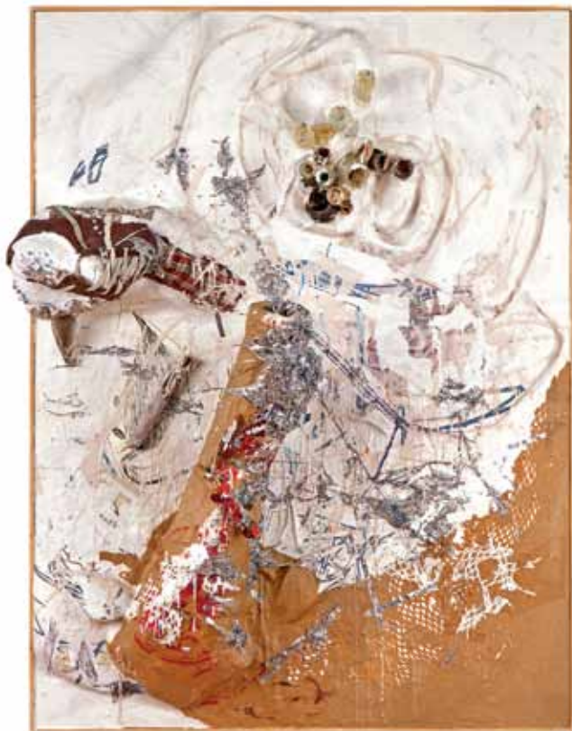
Randy Wray Limb , 2011

particle smashers used in physics experiments. The work is mounted on actual casters to facilitate easy rolling. Many of his sculptures appear top heavy and lean to one side as if in the act of falling or rising. Multi-colored shredded paper often covers surfaces creating a vibratory optical sensation of motion. Old Converse sneakers allude not only to the artist's literal movement but also to his agility in his artistic explorations. At times his abstract forms evoke vehicles such as trains, ships and horses. In Wray's work, transportation serves as a metaphor for transformation.