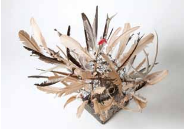
Arthur Simms Face Mon , 2014

leaves the wood exposed in his rough, tangled constructions that typically incorporate nails, rope and wire. Wray usually uses the wood to fashion armatures that become substructures buried beneath multiple layers of foam and papier-mâché.