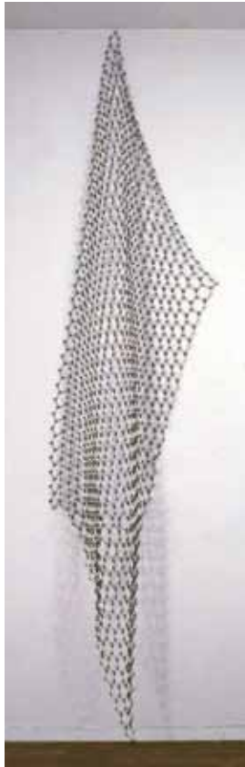
Tamiko Kawata Vertical Wave , 1988

Nari Ward turns the same grin into Sugar Hill Smiles , 2014—commodities in cans that we can buy and sell. In one way, Ward’s intentionally commercial display mounts a public relations campaign to turn Harlem’s Sugar Hill neighborhood into a more desirable commodity. In another way, he makes fun of people who try to sell trumped up or worthless things (like the Emperor’s New Clothes). Biggers, Ward, and the other artists in the exhibition remind us that cultural markers are in constant flux and should not be considered permanent. At the same time, Biggers and Ward re-position negatively-loaded cultural symbols into positive ones to upend former racist associations. They proudly reclaim African, Caribbean, and African American achievements and values that have correspondences worldwide.