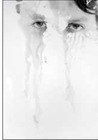
Kambui Olujimi Untitled (from Mourners, series) , 2010

the expectation of traditional portraiture, especially in photography. These unique photographs are abstracted portraits from the Wayward North project, 2010. Using a customized developer, Olujimi selectively processes portions of the image and builds up the multiple layers. Identities are obscured, and the portraits become melancholic and morose.