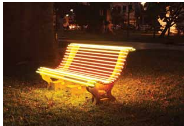
Iván Navarro & Courtney Smith Street Lamp (Yellow Bench) , 2012

Yinka Shonibare's Black Gold Toy Painting 6 , 2006, breaks all traditional “rules” of painting. The work can be hung from any direction, so there is no privileged point of view. On the 2 ¼-inch side of the painting, model soldiers and US war planes pose atop Dutch-manufacture fabric with African designs. The toys and fabric point to the ongoing legacy of colonialism and military intervention in Africa. This side panel with action figures gives the painting a sculptural dimension. Thick black brushstrokes on the main surface defy all notions about brushstrokes. The sole variation from black, a border of gold hook-like forms, imitates the fabric design. Shonibare wryly intermixes painting, sculpture, and decoration to take deadly aim at the legacy of colonialism in the world.