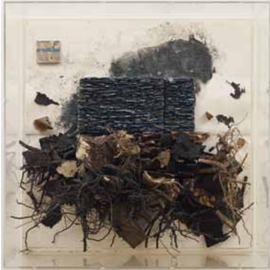
Leonardo Drew Number 134D , 2012

such as safety pins, to create works that are not only personal reflections but also examinations of the environment. After moving from Japan to the United States, Kawata used safety pins for a practical reason—to shorten clothes—and the pins have become a significant part of her oeuvre. Kawata subconsciously connects the two cultures, and Vertical Wave , 1988, references water, an important symbol in Japanese culture.