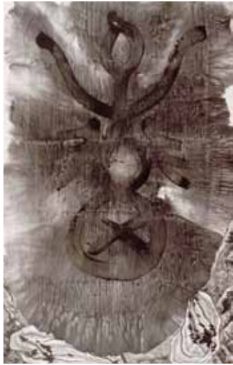
Wenda Gu Mythos of Lost Dynasties, Painting E-1, 1997-98