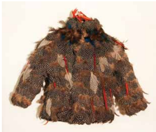
Sanford Biggers Ghettobird Tunic (Baby) , 2003

In Sanford Biggers’ art, trees for lynching may become pianos making music or welcoming spring. At the Brooklyn Museum Biggers’ Blossom , 2007, features a player piano playing the artist’s original variation of Billie Holiday’s “Strange Fruit”, a song that protested lynching. Ghettobird Tunic (Baby) , 2003, is Biggers’ wearable bird-boy invention. It is a metaphorical response to helicopters, nicknamed Ghettobirds, that hover above the Los Angeles (and perhaps other) minority neighborhoods photographing ‘suspects’ and looking for crime. The Tunic comes in three sizes—to disguise the identities of men, youth, and children from the stigmatizing photos of police air patrols. Biggers thus addresses and transforms signs of past persecutions of black males into powerful camouflaging objects. In Cheshire , 2008, Biggers uses a symbol familiar to Europeans as the wide grin of Alice in Wonderland’s Cheshire Cat or the half-moon to undercut American views of the Negro minstrel’s grin. His signifiers intermix diverse signs, cultures and histories to introduce viewers to new perspectives on established symbols and histories.