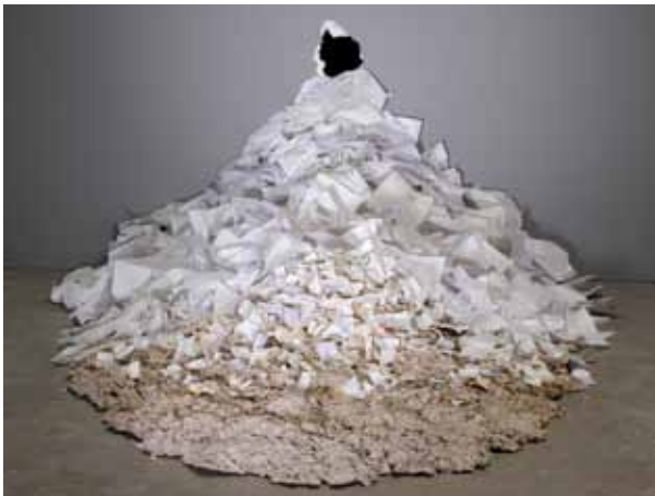
Ginny Huo 1,000 Phobias, 2008

cultural role of black women as animals and laborers, and the American imagination.