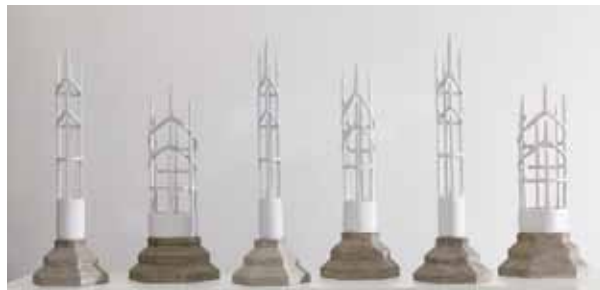
Afruz Amighi Crowns , 2014

The phrase “New Ways of Seeing” acknowledges that many past and present interpretations of culture are flawed, incomplete, or even false. As we know, scholars from ancient to Post-Colonial and Postmodern times had different views and agendas, often excluding women. In another direction, cultures borrow from, adapt, and change each other in myriad ways. For example, Yinka Shonibare’s art illustrates how Dutch fabric imitations of African art play with notions of authenticity. Shonibare views most constructs of (African and other) cultures as inauthentic. From an anthropologist’s view, Edward T. Hall argues, “context, in one sense, is just one of the many ways of looking at things.” 2 For these artists, there are many contexts. As John Berger’s Ways of Seeing notes “...the way we see things is affected by what we know or what we believe [...] the more imaginative the work, the more profoundly it allows us to share the artist’s experience of the visible.” 3 We push beyond his notions as well.